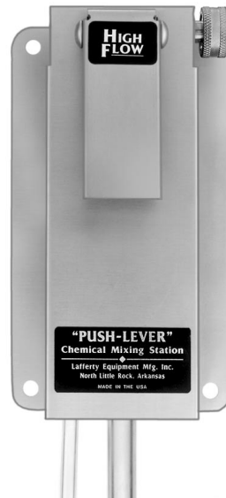
MODEL # 980100